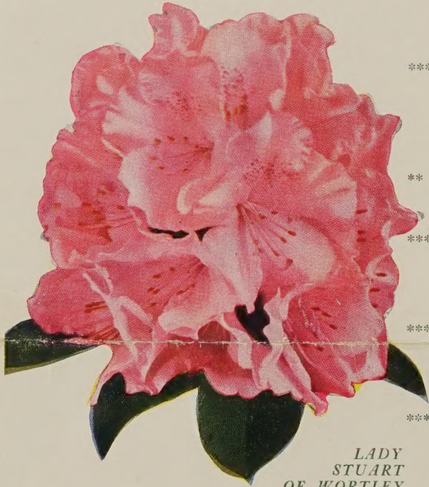
LADY STUART OF WORTLEY

**** PENJERRICK (C) (campylocarpum x Griffithianum) Loose trusses of large bell shaped creamy yellow flowers. Considered in England to be one of the best hybrids yet created. Midseason bloom.